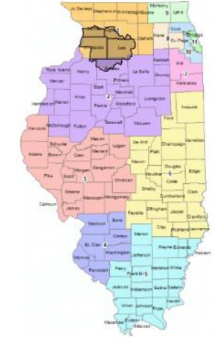
Figure 1: SVCC District (light black overlay) and Restore Illinois Health Regions.

The College is tracking the number of new daily cases for our District Counties on a 28-day rolling average. The average of the prior 14-day